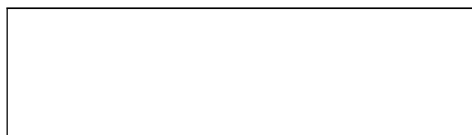
Legible signature of persons entitled to represent the Cedant